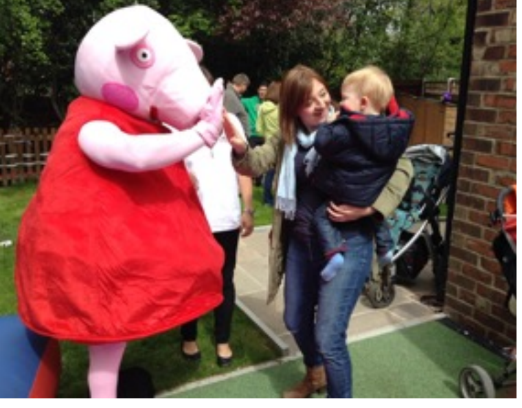
May - Family Fun Day! A happy day full of fun and a visit from Peppa Pig. It was also a very busy day and we loved seeing everybody together. It was a good opportunity for families to meet each other. We will definitely be having another fun day in 2016.