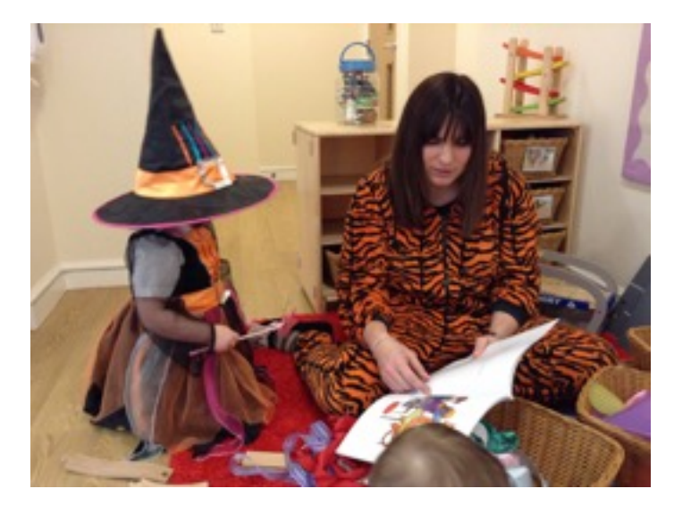
March - World Book Day, the children and staff came to nursery dressed as their favourite character. We also took a trip to the library together to share stories.