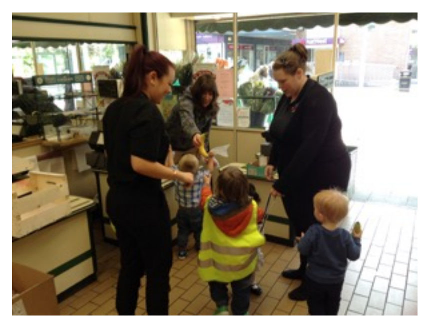
June - The children and staff love going out and about in our village, Bramhall. We frequently make stops to the grocery shop to treat ourselves to a healthy snack.